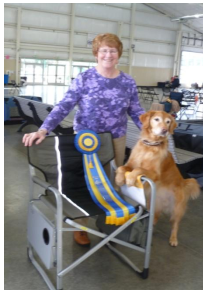
OTCH Webshire's X-pecta Freeze UDX3 OM6 VER RE JH NA NAJ