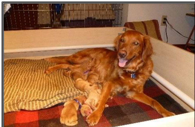
Proud mother, Tiki, gave birth to five golden males and two females on January 18, 2013.