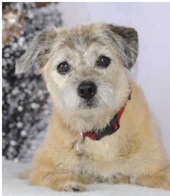
Ollie, the people pleaser and entertainer, charmed everyone.

Ollie was truly a wonderful dog, and he had the most lovely temperament. He was so friendly and sweet we felt comfortable taking him anywhere. He got along with all people, children, and other dogs. I took competition classes with him starting at age 1, and he was my Novice A dog. After he earned his CD, we went on to show many times in Novice B. His last appearance in Nov. B was at a Terrier Show where he got High In Trial! I was so proud of him.