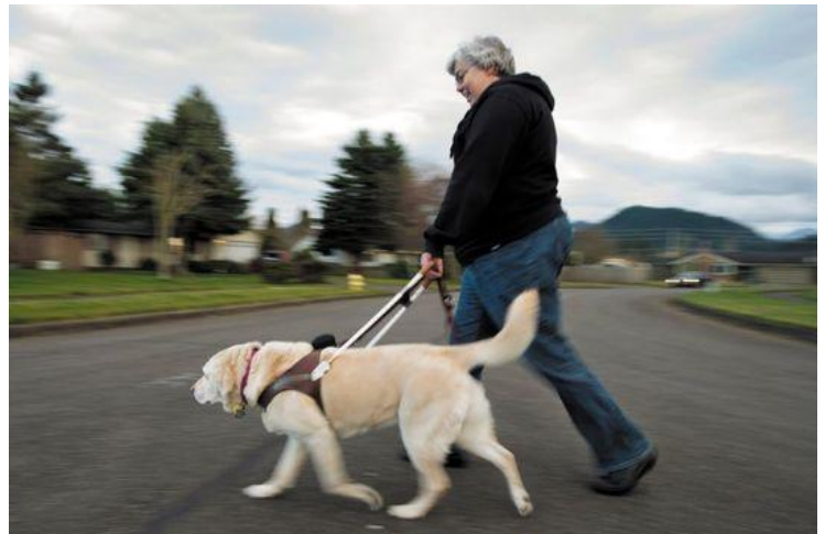
Cranberry, UD BN GN GO RE TH, enjoys life as a guide dog, a competition obedience dog and as a pet when not working.