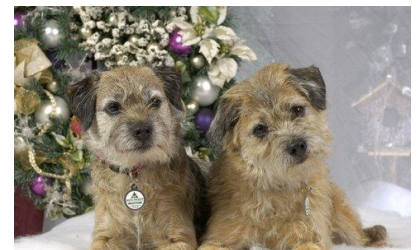
Luke, left, and Ollie, right, loved running together on Oregon Coast beaches.

It's hard to imagine our lives without our beloved Oliver. He was a good dog and a happy presence in our home for 16 years. He will be forever missed. Goodnight sweet Ollie, we will love you always. God bless.