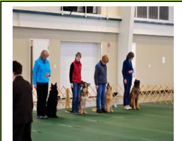
Open B stay lineup with the usual suspects at WSOTC's 2013 obedience trial.