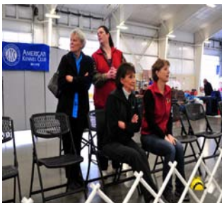
Hangin' out at the show!