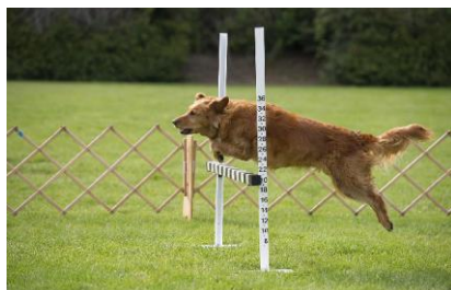
Tiki taking the bar jump!