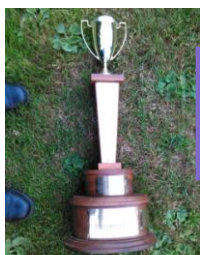
Louis Prince Plaque